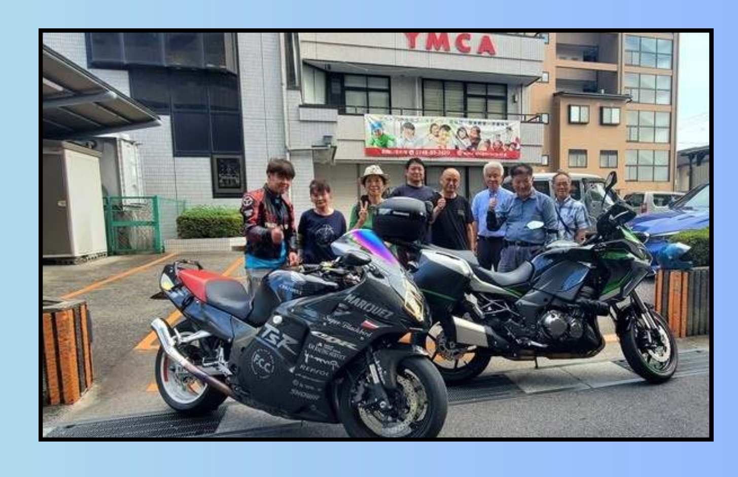
Fellowship by bike tour

Y's Men's Club of Taichung Ever Life celebrated their 30th Anniversary on 21st September 2024 together with IBC Club Silver State Y's Service Club, Malaysia and IBC Club from Japan. It was a very grand celebration with lion dance, releasing paper lanterns on the stage, honoring the 30 Past Presidents and distributing generous donations to various charities.